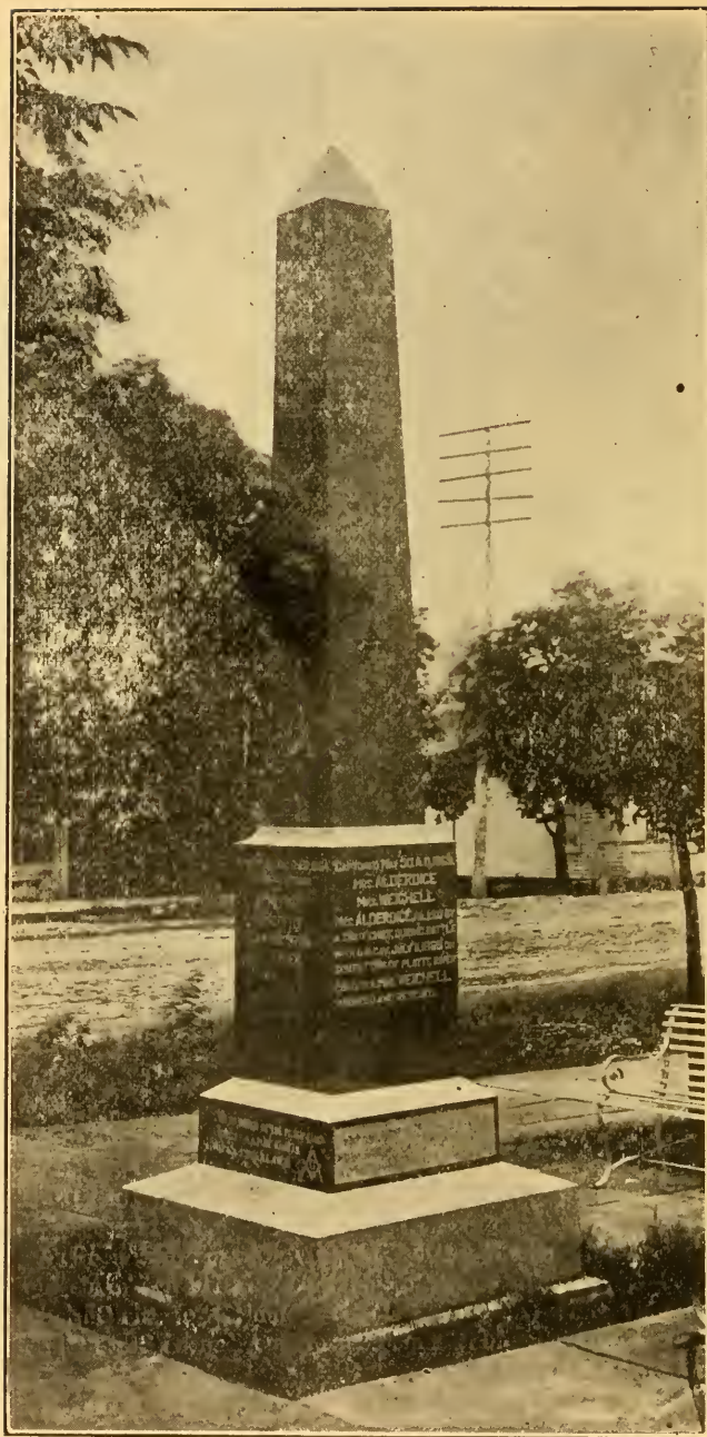
Northeast View Pioneer Monument