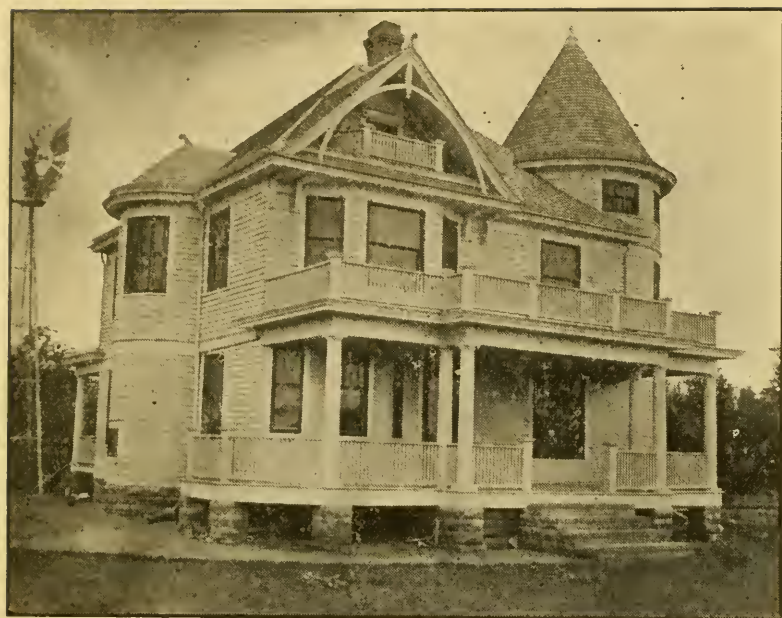
AS IT IS IN 1910