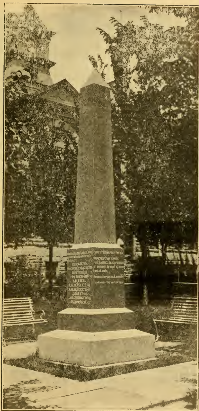
Southwest View Pioneer Monument